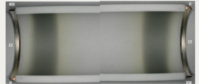
Normal pattern of MVD on VI Ceramics