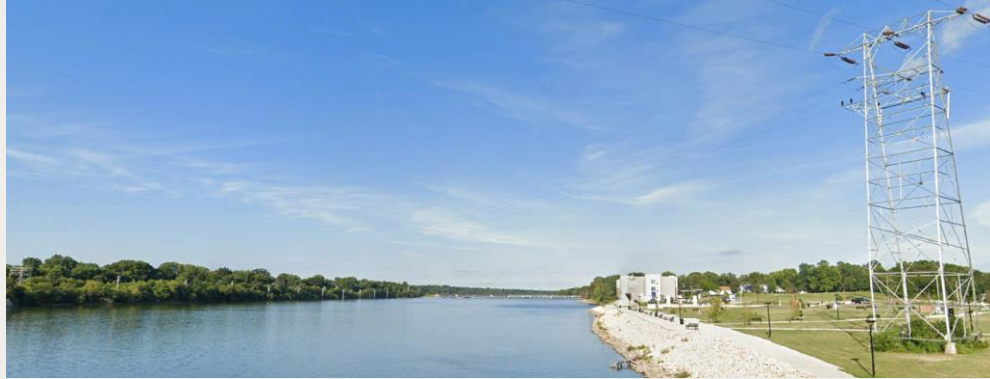
1,500' river crossing and lattice structure