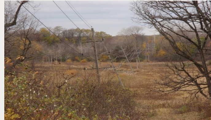
10,000' inaccessible wetlands