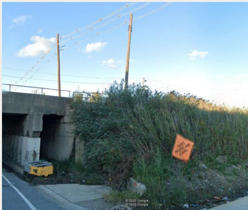
Triple circuit crossing at Rail Road overpass Group Discussion Meeting