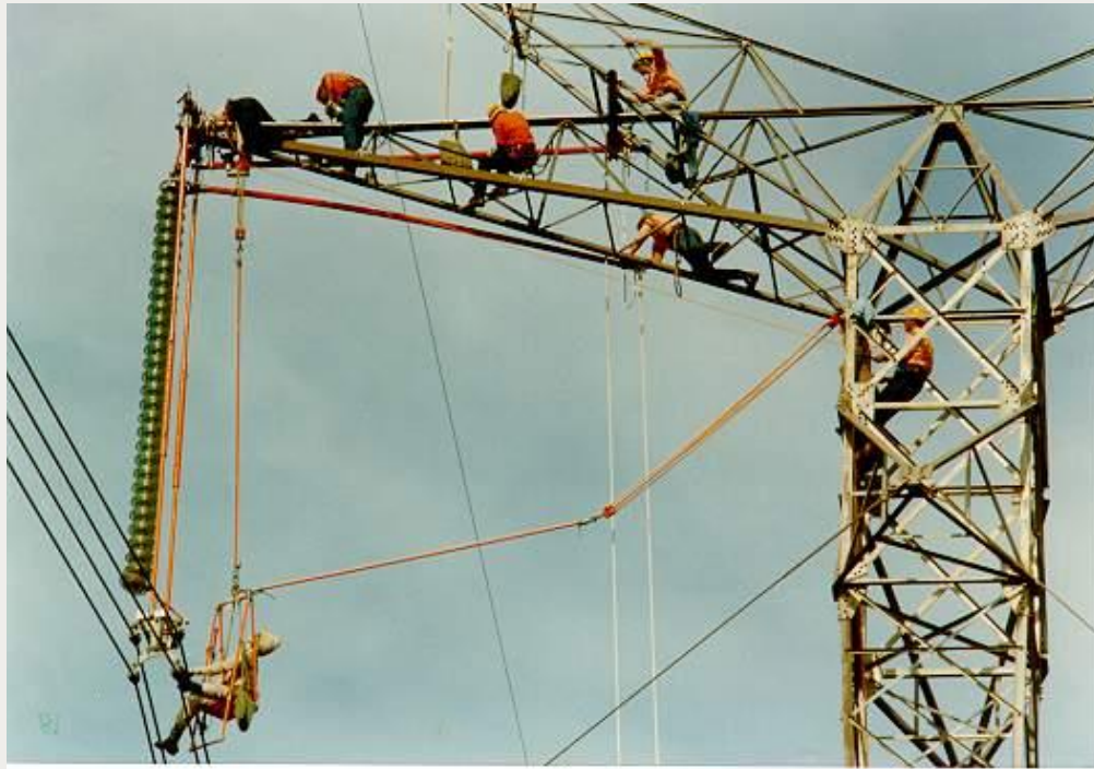
Group Discussion Meeting